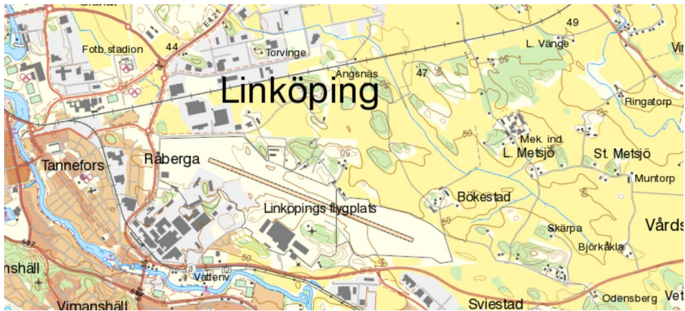
Figure 1 Section from Topography 50 Download, vector