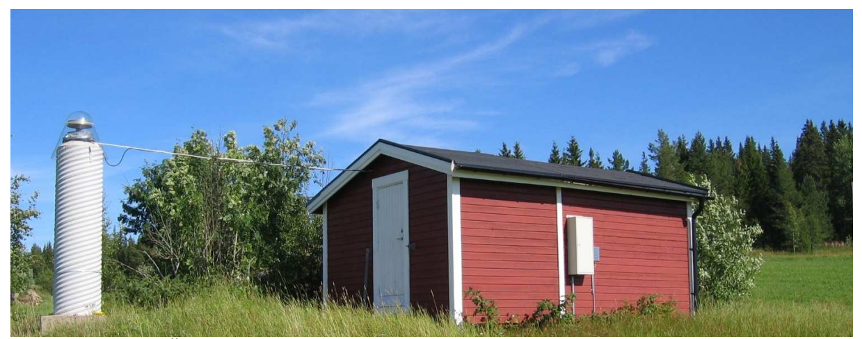
Figure 2-1: Östersund is one of the 21 first SWEPOS stations belonging to Class A.

All 161 SWEPOS stations are equipped with dual-frequency GNSS receivers, which track both GPS and GLONASS signals. Data is collected every second and a 5 degrees elevation mask is used. The GNSS antenna at every station is a choke-ring antenna of Dorne Margolin design mounted under a radome. The radomes are made of clear acrylic.