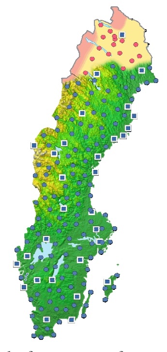
Figure 1-1: The SWEPOS network of permanent reference stations for GNSS consists of 161 stations covering Sweden. Red dots are planned stations.

The SWEPOS network is operated by Lantmäteriet, the National Land Survey of Sweden. Today (spring 2008), the network consists of 161 stations for both GPS and GLONASS operation, see Figure 1-1.