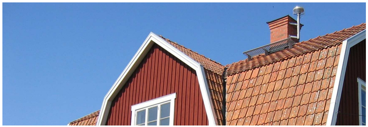
Figure 2-2: Söderboda is a SWEPOS station with a roof-mounted GNSS antenna mainly established for network RTK purposes belonging to Class B.

All 161 SWEPOS stations are equipped with dual-frequency GNSS receivers, which track both GPS and GLONASS signals. Data is collected every second and a 5 degrees elevation mask is used. The GNSS antenna at every station is a choke-ring antenna of Dorne Margolin design mounted under a radome. The radomes are made of clear acrylic.