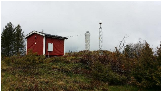
Figure 4.1: Sveg is one of the SWEPOS stations belonging to class A. It has both a new monument (established in 2011) and an old monument (from 1993).

The class A stations are monumented on bedrock and have redundant equipment for GNSS observations, communications, power supply etc. They have also been connected by precise levelling to the national precise levelling network. Class B stations are mainly established on top of buildings for network RTK purposes. They have the same instrumentation as class A stations (dual-frequency multi-GNSS receivers with antennas of Dorne Margolin choke ring design), but with somewhat less redundancy.