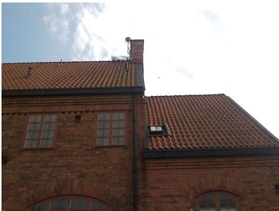
Figure 4.2: Vagnhärads is a class B SWEPOS station with a roof-mounted GNSS antenna mainly established for network RTK purposes.

The 21 original class A stations have two kinds of monuments; the original concrete pillars as well as new steel grid masts, see Figure 4.1. The new monuments are equipped with individually calibrated antennas and radomes of the type LEIAR25.R3 LEIT.