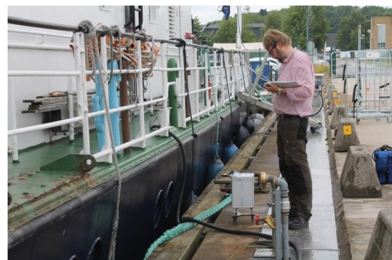
Figure 9.1: Harbour tie gravity measurement made by Lantmäteriet in the FAMOS project.

In FAMOS, Lantmäteriet is working mainly with activity leading (of activity 2), marine gravimetry, evaluation of existing gravity data/databases and geoid computation. Lantmäteriet has recently procured a ZLS marine gravimeter, which was delivered in April 2017. We further work with connecting the Swedish tide gauges to RH 2000 as well as with evaluating different real-time GNSS navigation methods at sea.