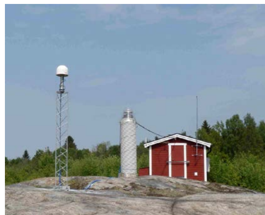
Figure 2: The SWEPOS station Hässleholm with the new monument (established in 2011) and the old monument (established in 1993).

The SWEPOS Network RTK Service reached national coverage during 2010. Since data from permanent GNSS stations are exchanged between the Nordic countries, good coverage of the service in border areas and along the coasts has been obtained by the inclusion of 20 Norwegian SATREF stations, 5 Finnish Geotrim stations, 3 Danish Leica SmartNet stations and 2 Danish Geodatastyrelsen (Danish Geodata Agency) stations.