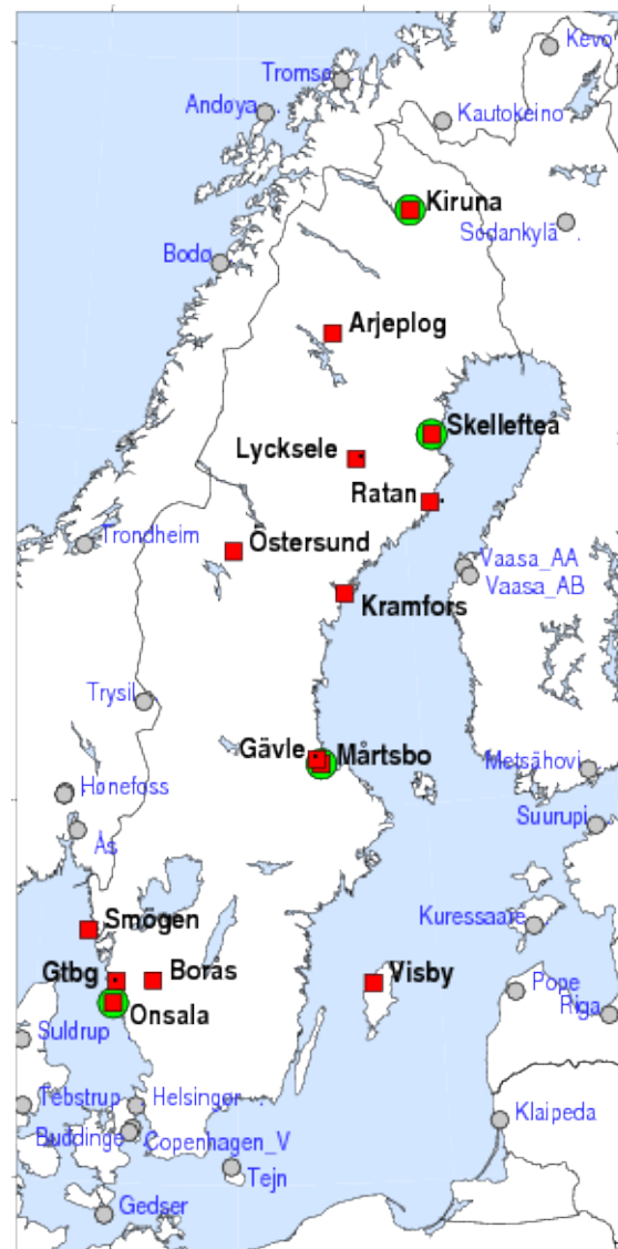
Figure 3: Absolute gravity sites in Sweden (red squares, and sites in neighbouring countries (grey circles). Sites with time series >15 years have a green circle as background to the red square.

In order to improve the Baltic Sea geoid model, Lantmäteriet is also engaged in the FAMOS (Finalising Surveys for the Baltic Motorways of the Sea) project. The main purpose of FAMOS is to finalise hydrographic surveying in those areas of the Baltic Sea that are of interest for commercial shipping. In the Harmonising vertical datum activity of the project, the main goal is to improve the geoid over the Baltic Sea area, to provide an important basis for future offshore navigation. To reach the goal of an improved geoid model, new marine gravity data will be