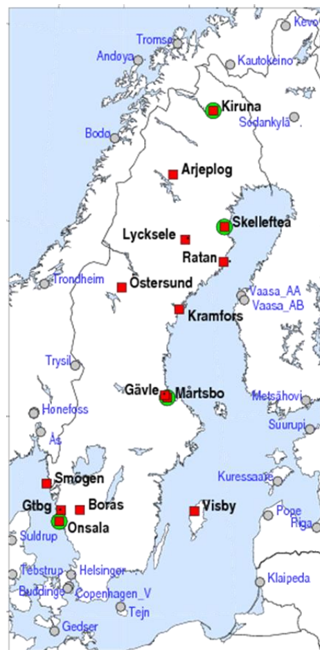
Figure 8.1: The 14 absolute gravity sites in Sweden (red squares) and sites in neighbouring countries (grey circles). The four sites with time series more than 15 years long have a green circle as background to the red square.

Absolute gravity observations have been carried out at 14 Swedish sites since the beginning of the 1990's, see Figure 8.1. All sites, except for Göteborg (Gtbg) which no longer is in use, have been observed by Lantmäteriet since 2007. The observations have been carried out with an absolute gravimeter (Micro-g LaCoste FG5 - 233), which Lantmäteriet purchased in the autumn of 2006. The objective behind the investment was to ensure and strengthen the observing capability for long-term monitoring of the changes in the gravity field due to the Fennoscandian GIA 17 .