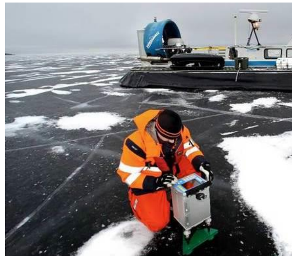
Figure 7.1: Relative gravity measurements in March 2011 on Lake Vänern, the largest lake in Sweden.

According to Geodesy 2010, the ultimate goal is to compute a 5 mm (68 %) geoid model by 2020. To reach this goal – to the extent that it is realistic – work is going on to establish a new gravity network/system as well as to improve the Swedish detail gravity data by new gravity measurements. One region where such measurements have been performed is on Lake Vänern (Ågren et al., 2014a), see Figure 7.1.