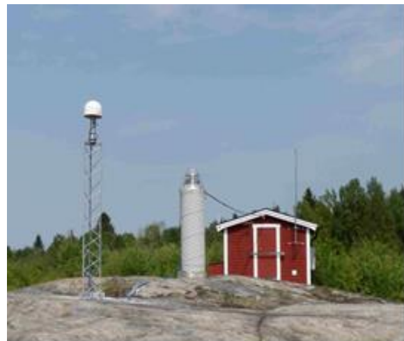
Figure 3.1: Hässleholm is one of the SWEPOS stations belonging to class A. It has both a new monument (established in 2011) and an old monument (from 1993).

By the time for the EUREF Symposium in June 2015 SWEPOS consisted of totally 355 stations, 38 class A stations and 317 class B ones, see Figures 3.1 and 3.2. This means that the total number of SWEPOS stations has increased with 46 stations since the previous EUREF Symposium one year ago, see Figure 3.3.