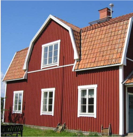
Figure 3.2: Söderboda is a SWEPOS station with a roof-mounted GNSS antenna mainly established for network RTK purposes belonging to class B.

The class A stations are built on bedrock and have redundant equipment for GNSS observations, communications, power supply, etc. They have also been connected by precise levelling to the national precise levelling network. Class B stations are mainly established on top of buildings for network RTK purposes. They have the same instrumentation as class A stations (dual-frequency multi-GNSS receivers with antennas of Dorne Margolin choke ring design), but with somewhat less redundancy.