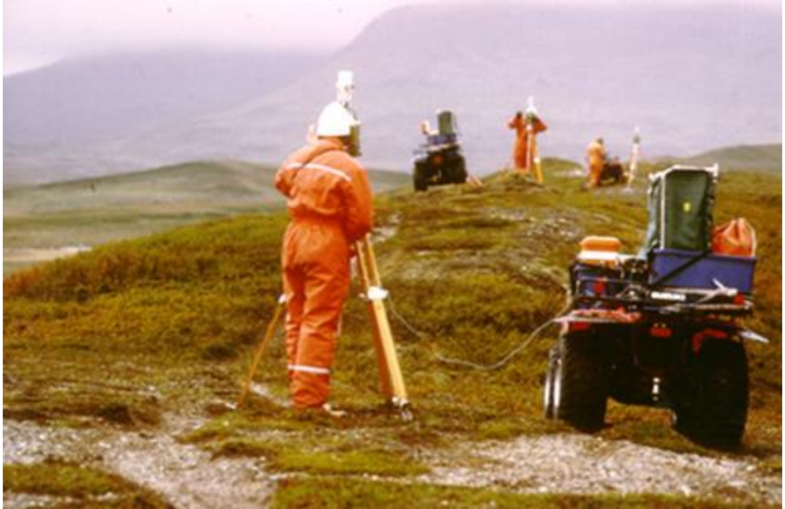
Figure 12: "MTL" using ATV vehicles in the Swedish mountains near the Norwegian border in 1990.