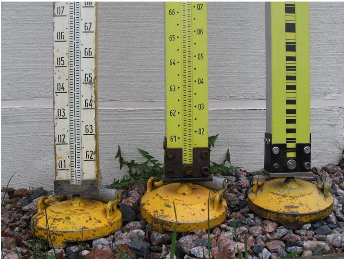
Figure 13: From the left Zeiss Jena 5 mm graduation rod with wooden frame, Nedo 5 mm graduation rod with aluminium frame and Nedo LD 13 bar code rod with aluminium frame.

In Finland Zeiss Jena rods with 5 mm scale division and wooden frames were used during the period 1978–1997. Nedo aluminium rods have been used since then. The rods were usually 3 m long, but also 2 m long rods and rods with an enlarged rod scale have been used, see figure 13.