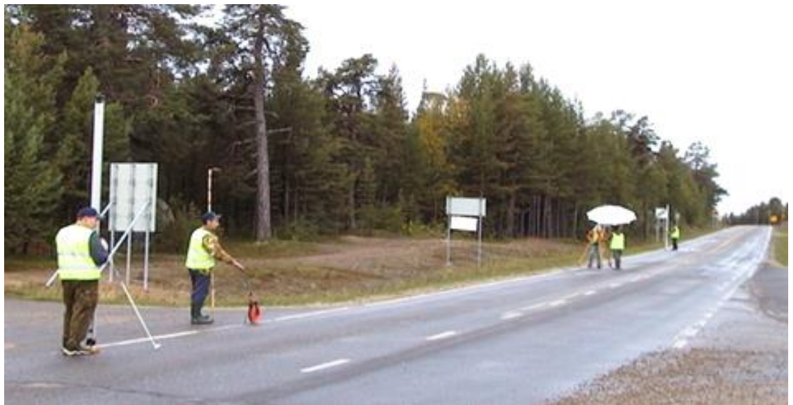
Figure 18: A precise levelling expedition in Inari in 2002.