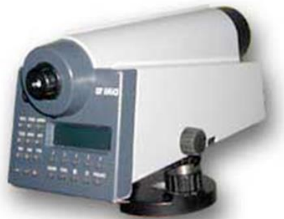
Figure 8: Zeiss DiNi 10.

Today's model for precise levelling from Zeiss is Trimble DiNi12/DiNi0.3, see figure 10. The standard deviation for these instruments is specified to 0.3 mm for 1 km double run. There are a number of other brands on the market, specified for both precise levelling and lower order measurements, but in the Nordic countries DiNi11 or DiNi12/DiNi0.3 has been mostly used.