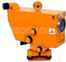
Figure 5: Zeiss NI002 from Jena.