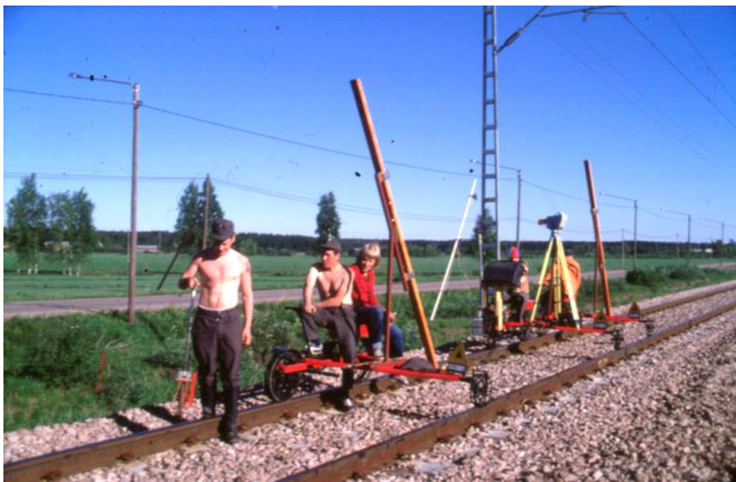
Figure 16: Handcar levelling in Inkeroinen in 1979.

Using the handcar method along railroads, a levelling team had three vehicles. Two handcars were used for the rod men and one was in common for an observer and a record keeper. The handcars of the rod men had a rack for transporting the rod in the vertical position. The handcar of the observer was equipped with a table and racks for a level and a differential thermometer. A distance measurer walked along the rails and marked the locations for set ups and rod bases, see figure 16.