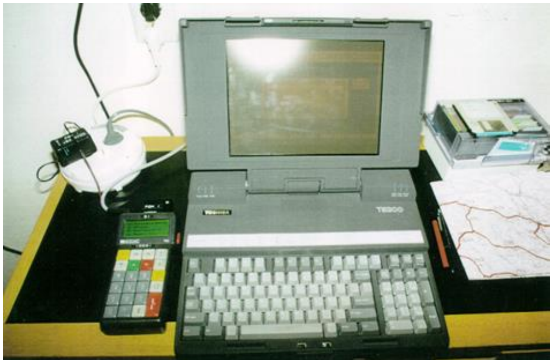
Figure 24: Dumping the daily Swedish levelling data from the field computer to a PC with a 35 Mb hard disc at the hotel in 1990.

Also the handling of the benchmark descriptions and benchmark maps has been made easier and more effective due to the development of the digital technique. The development of GIS systems e.g. MapInfo made it possible to use digital maps, which was a huge improvement.