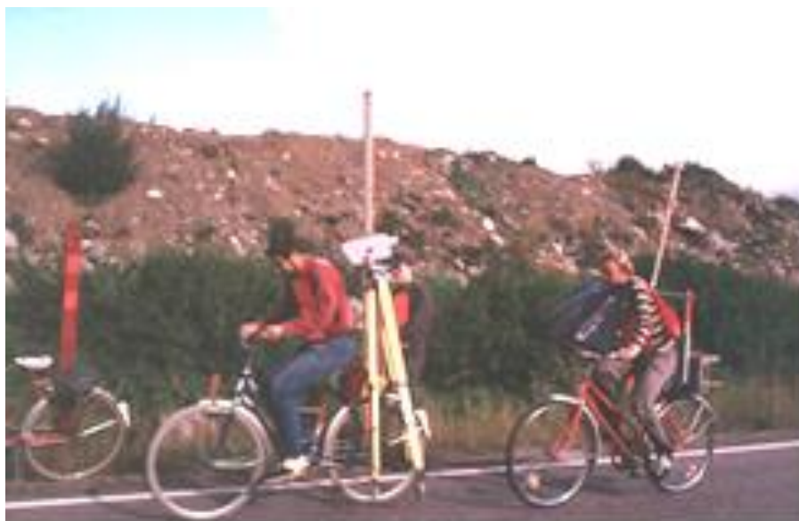
Figure 15: Bicycle levelling in Hyvinkää 1979.