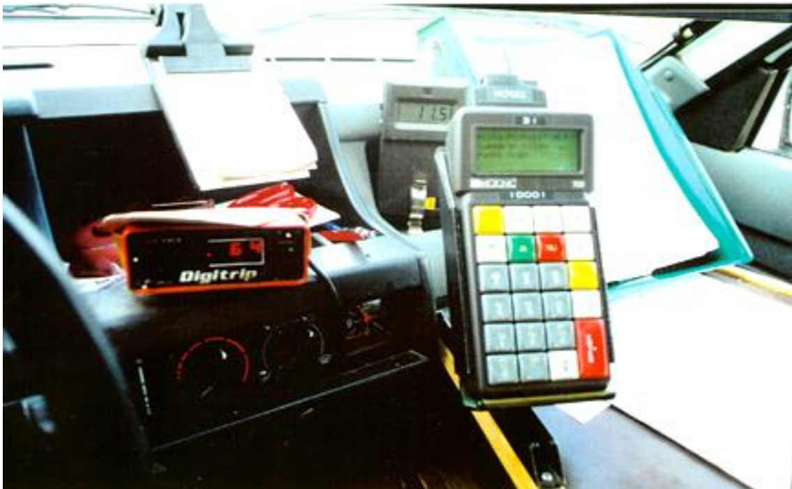
Figure 21: Interior from a Swedish ML instrument car 1995, with the data logger, Digitrip distance meter and air temperature display.

Each set up had to pass the programme controls before the work could proceed. Complementary information was stored as well, e.g. identity of the observer, instrument number, rods identification, air temperature, type of weather and road surface, (Lilje and Eriksson 2007).