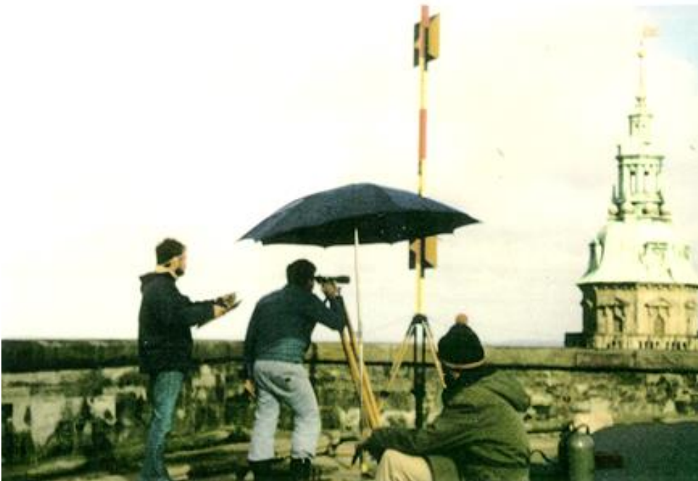
Figure 11: Trigonometric water crossing over Öresund between Kronborg and Pålsjö klint in 1981, using Wild N3, a joint project between KMS and LM.

It was an advantage to be able to carry out the entire field production with the same type of equipment all through the project, even if e.g. the digital levels were accessible from the middle of the 1990's. This made the whole work equivalent and homogeneous. However, for densification and updating of the network DiNi12 and DiNi0.3 have been used since 2004.