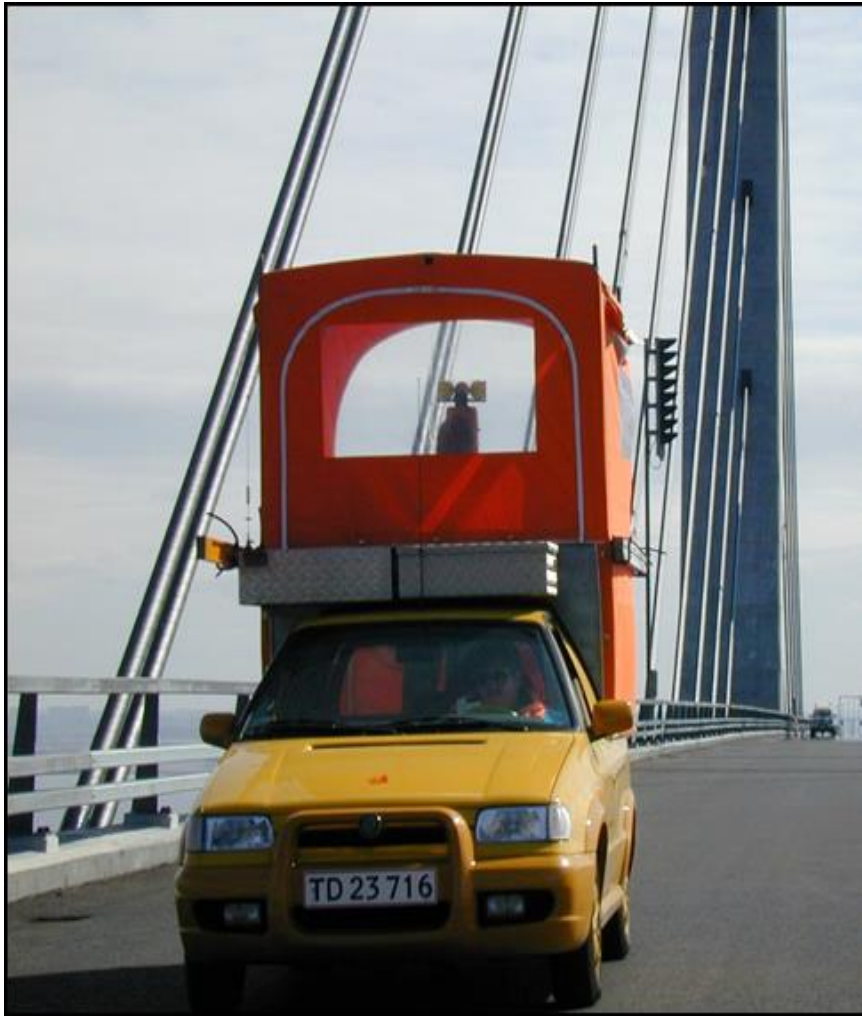
Figure 25: A Danish MTL car on the Öresund bridge in 2000.