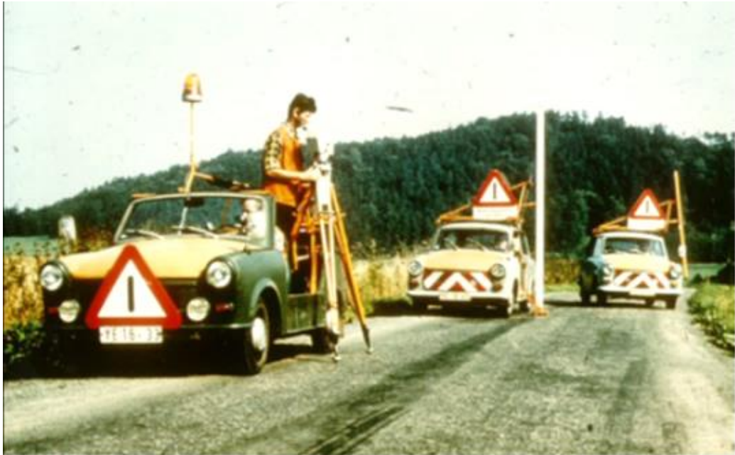
Figure 3: A motorised levelling team at work in former DDR in 1973.