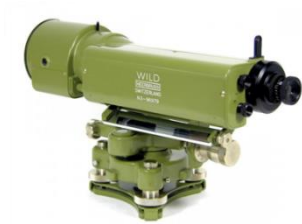
Figure 4: Wild N3 from Heerbrugg.