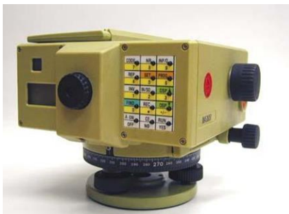
Figure 7: Leica NA 2000.

In 1990 the first digital level, Leica NA2000 was introduced, see figure 7 and four years later Zeiss introduced their first digital level, DiNi10, see figure 8. Leica have improved their digital levels several times, and today's model for precise levelling is DNA03, see figure 9. The successor to DiNi10, designed for precise levelling, DiNi11 was released in 1996.