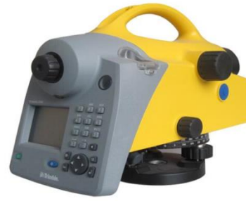
Figure 10: Trimble DiNi 0.3.

The ML technique in combination with NI002 was used In Denmark during the whole third precise levelling (1982–1994), and even until 1999 in lower order networks. ML and NI002 were taken in use as early as in 1980.