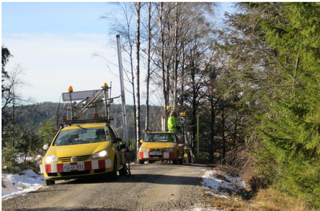
Figure 20: A Danish ML team in Sweden in 2010.