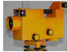
Figure 6: Zeiss NI002A from Jena.

The factory and the service laboratory in Jena was closed down in 1992 and moved to Zeiss in Oberkochen. At the same time the manufacture of NI002 was also closed down.