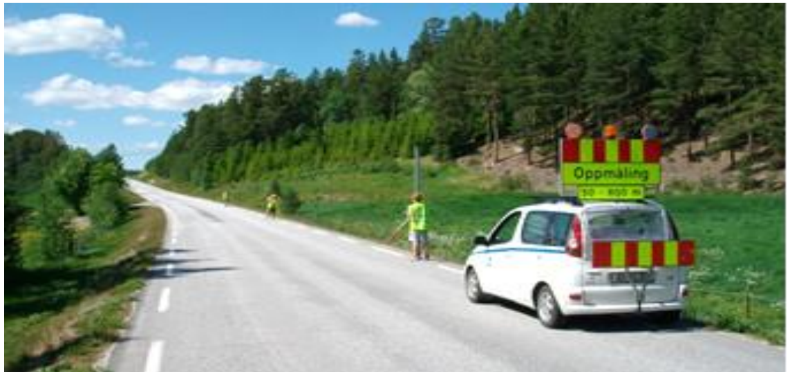
Figure 17: A Norwegian FL team with a protection car in 2009.

The rod cars are small sedan cars, and have a divisible driver's door so that the driver can operate the rod from the driver's seat. On the roof a frame is mounted to hold the rod, and a device that also allows the driver to turn the rod from forward to backward. During the transportation between setups, the rod is fastened in a hook on the door. Also the rod cars are equipped with Digitrip distance gauges. It is an advantage to have small cars, so that they can pass each other on narrow roads.