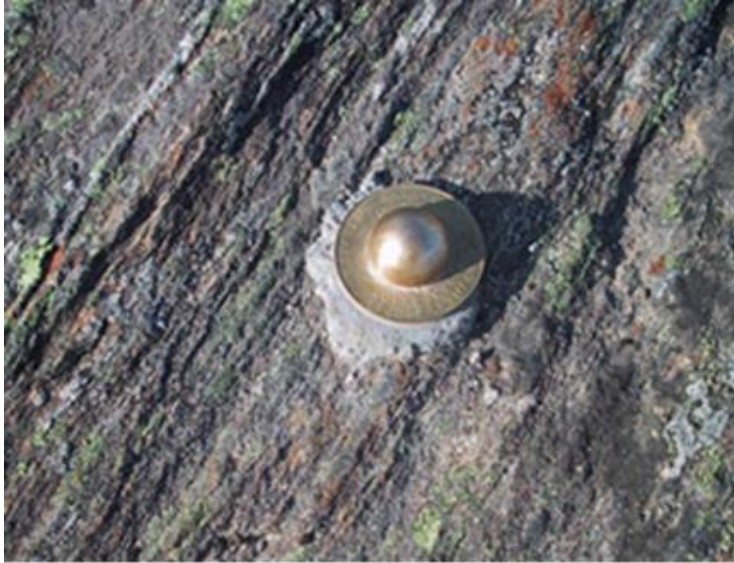
Figure 1: A Norwegian benchmark in bedrock.