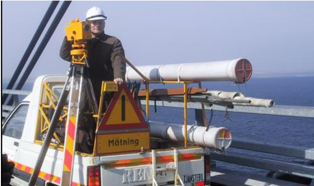
Figure 19: A Swedish ML instrument car on the Öresund Bridge in 2000.