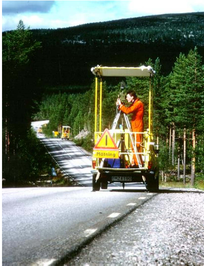
Figure 26: A Swedish MTL team in the Sälen area in 1985.