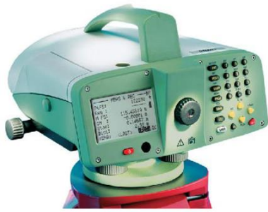
Figure 9: Leica DNA 03.