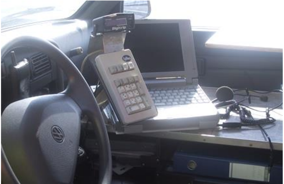
Figure 22: Interior from a Danish ML instrument car 2000, with the data logger, a computer and a Digitrip distance meter.