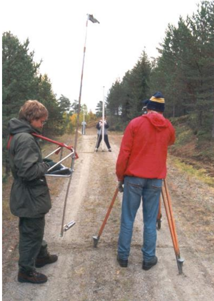
Figure 14: Adjustment of Wild N3 in 1996. The record keeper notes the rod readings on a Husky Hunter computer. As a part of the table there are temperature sensors 0.5 and 2.5 m above the ground.