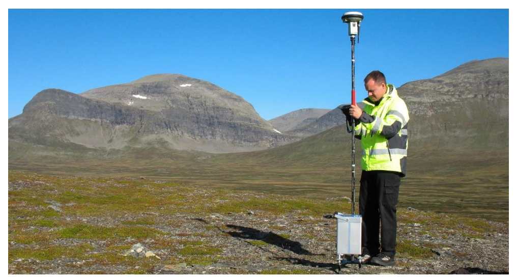
Figure 1.6: More than 3,400 new relative gravity measurements have been performed in Sweden since 2010. The heights of the locations are determined by network RTK measurements.

The work with NKG2015 was performed in the geoid model project of the NKG Working Group of Geoid and Height Systems. An update of the NKG gravity database for the whole Nordic-Baltic area and a creation of a new NKG GNSS/levelling database and a common DEM were also included in the project. Independent computations for NKG2015 were first made by five computation centres – from Sweden, Denmark, Finland, Norway and Estonia – using different regional geoid computation methods, software and set-ups. The modelling method utilised for the final model, the Least Squares Modification of Stokes' formula with additive corrections, was chosen based mainly on the agreement to GNSS/levelling. GNSS/levelling evaluations show that NKG2015 is a significant step forward, not only compared to previous NKG geoid models, but also with respect to other state-of-the-art ones covering the whole Nordic-Baltic area, e.g. EGM2008, EGG2015 and EIGEN-6C4.