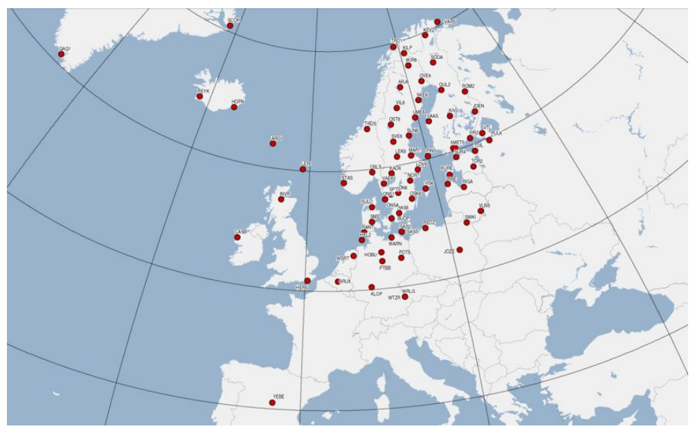
Figure 1.1: The NKG EPN AC sub-network of 88 permanent reference stations for GNSS.

The NKG GNSS analysis centre project was declared fully operational in April 2017 and it is chaired by Lantmäteriet (Lahtinen et al., 2018). The project aims at a dense and consistent velocity field in the Nordic and Baltic area. Consistent and combined solutions are produced based on national processing following the EPN analysis guidelines. A reprocessing of the full NKG network of reference stations including all Nordic and Baltic countries for the years 1997– 2016 has been completed and the time series analysis has been finalised during 2018.