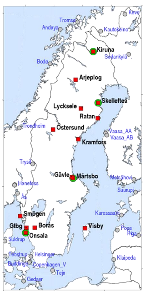
Figure 1.7: There are 14 absolute gravity sites (for FG5/FG5X) in Sweden marked with red squares in the map. Absolute gravity sites in neighbouring countries are marked with grey circles. The four sites with time series more than 15 years long have a green circle as background to the red square.

In the beginning of 2018, the new Swedish gravity reference frame RG 2000 became official (Engfeldt et al., 2018). The reference level is as obtained by absolute gravity observations according to international standards and conventions. It is a zero-permanent tide system in post-glacial rebound epoch 2000. RG 2000 is realised by the