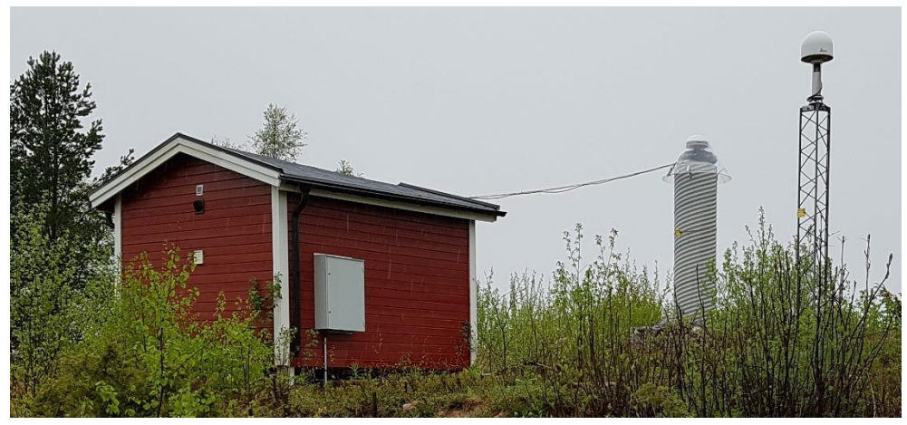
By the time for the 18th NKG General Assembly in September 2018 SWEPOS consisted of totally 401 stations (41 class A stations and 360 class B ones), see Figures 1.3 and 1.4.

Figure 1.3: Sveg is a SWEPOS class A station. It has both a new monument (established in 2011) and an old monument (from 1993).