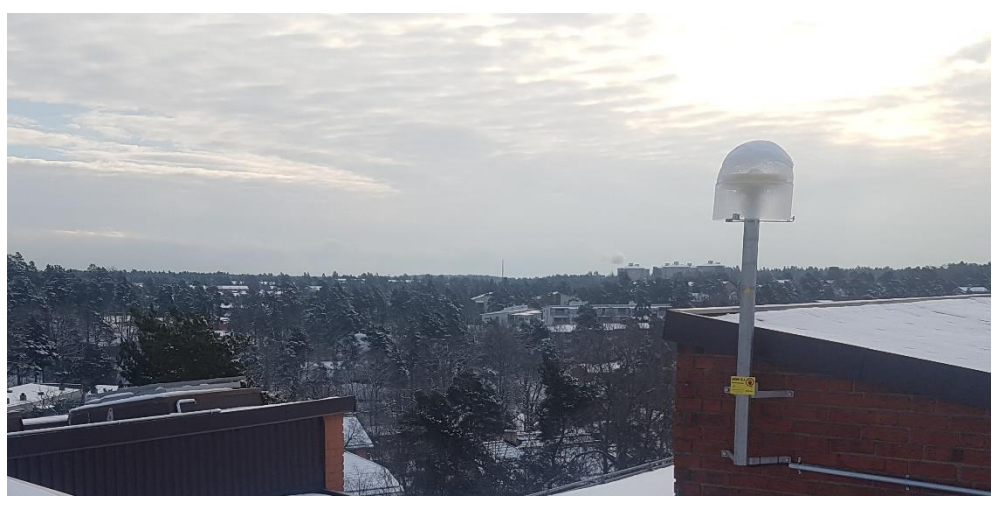
This means that the total number of SWEPOS stations has increased with 96 stations since the previous NKG General Assembly, see Figure 1.5.

Figure 1.4: Gustavsberg is a SWEPOS class B station with a roof-mounted GNSS antenna mainly established for network RTK purposes.